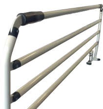
Side Rails 4H300SR