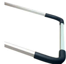
Wall Buffer 4H300WB