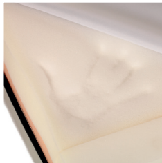
Mattress Pressure Care 4H320M