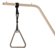
Self Help Pole 4H300SH